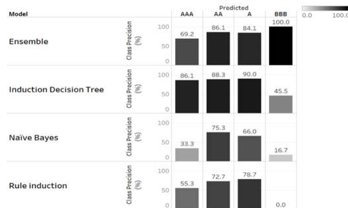
Figure 2. Comparison of class precision for each model

Figure 2 shows the comparison of class precisions among the models developed in this study. Despite a lower performance accuracy of ensemble model (see Table 1) as compared to IDT model, this model has proven to have the best ability to predict the rating with the highest risk, which is BBB in this study.