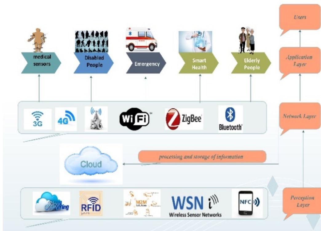
Figure 1. IoT reference architecture in healthcare

The IoT should be able to interconnect billions or trillions of heterogeneous objects across the Internet, so there is a critical need for a flexible architecture layers. The growing number of available architectures has not converged to a reference model. In the variety of models on offer, the base model is a 3-layer architecture consisting in the application, network, and Perception layers. The 3-layer structure is composed of Perception layer, the network layer and the application layer, as shown in Figure 1.[17].