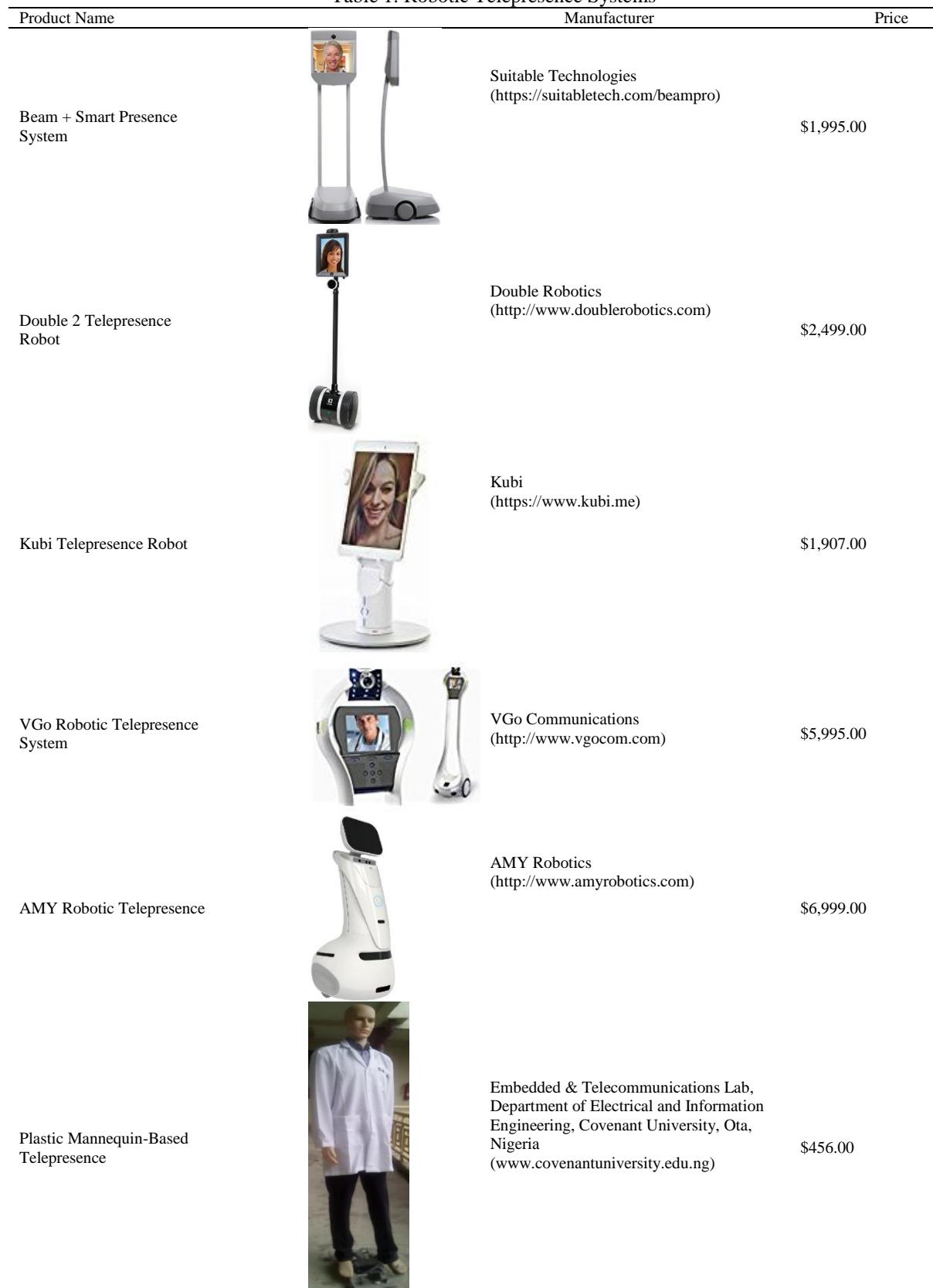
Table 1. Robotic Telepresence Systems