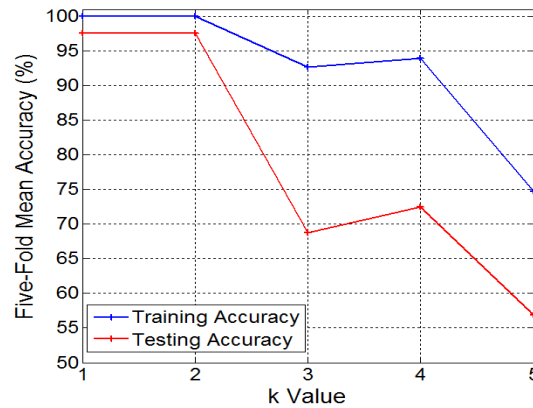
Figure 3. Five-fold mean training and testing classification accuracies for alpha and theta SCF features

The five-fold mean training and testing accuracies for k = 1 to k = 5 is shown in Figure 3. The best accuracies were obtained at k = 2 , with the training and testing yielding 100% and 97.5% accuracies, respectively. As k increases, both the training and testing accuracy decreases. This is mainly contributed by the fact that the classification technique works based on voting criteria. With increasing k , interference from other neighbouring but differently labelled features would be introduced and hence, affecting the classification accuracies.