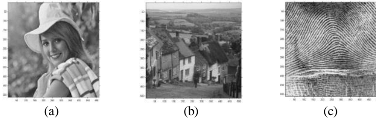
Figure 2. Watermark images: (a) Elaine, (b) Hill, (c) Fingerprint