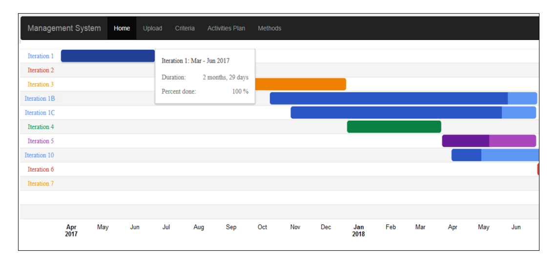
Figure 3. Excerpt of the progress of the development process page

Similarly, the management tool is connected with those tools. Bringing together these two environments using the management tool could well improve the communication between usability engineers and software developers. This communication link is essential to the development of a system as it is deemed efficient, also that it is pleasing and useful to the end user. In addition, effective communication saves time by reducing the inconsistencies in understanding thereby reducing the number of areas for debate. By using the plug-in feature, the management tool will consolidate both fields and promote the precision and completeness as a result of the development process.