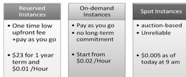
Figure 1. Pricing models

The Spot Price fluctuates based on supply and demand for instances, but customers will never pay more than the maximum price they have specified. If the Spot Price moves higher than a customer's maximum price, the customer's instance will be shut down by the cloud provider [9]. Figure 1 shows three pricing models.