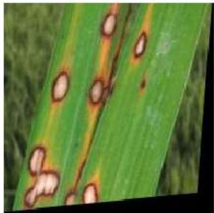
f) Shear Transform