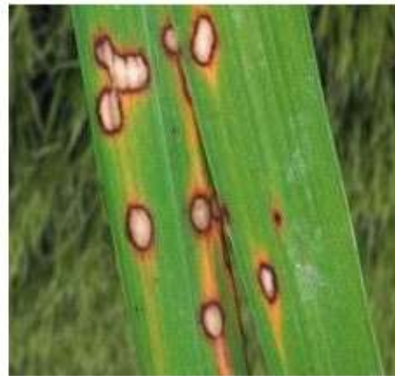
c) Vertical Flip