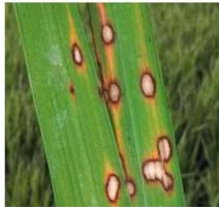
b) Horizontal Flip