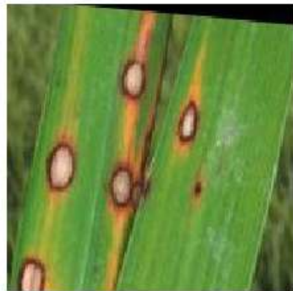
g) Random Zoom