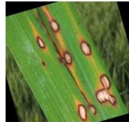
e) Random Rotation