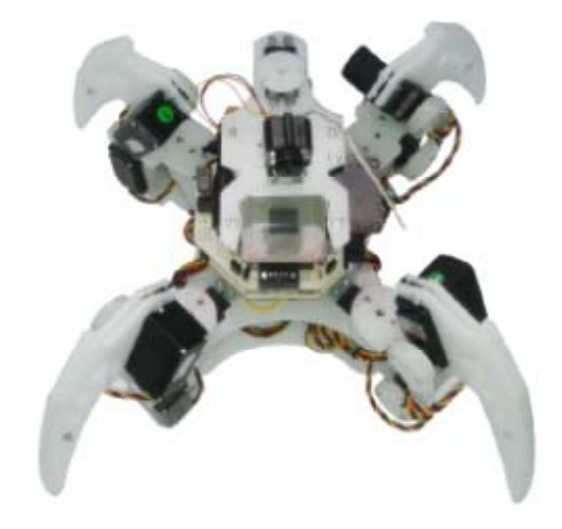
Figure 4. Physical performance of quadruped robot

The result of controller application based on Windows when the command "rest" is activated, is shown with Figure 5 whereas Figure 6 is a display when the command "ready" is activated. The numbering in red with moderate size, which laid on each of controller application facility, is intended to help explain the description of each facility.