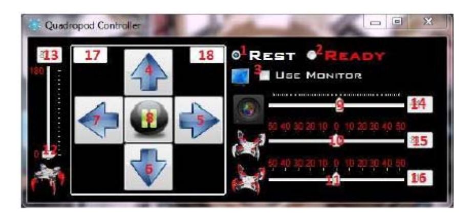
Figure 5. Controller applications display with active rest

The result of controller application based on Windows when the command "rest" is activated, is shown with Figure 5 whereas Figure 6 is a display when the command "ready" is activated. The numbering in red with moderate size, which laid on each of controller application facility, is intended to help explain the description of each facility.