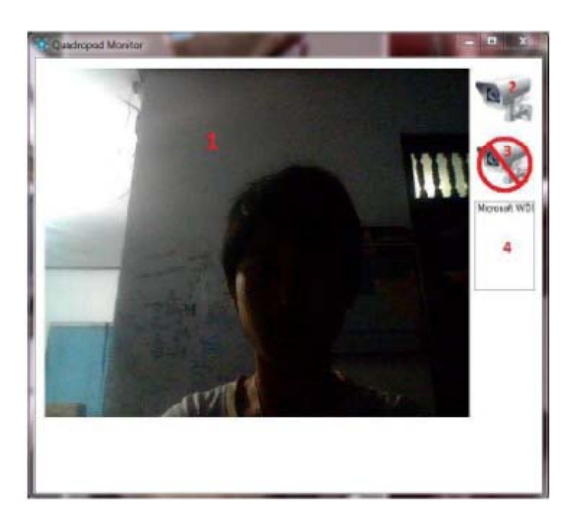
Figure 8. Video application display preview

The display result of video display application is shown on Figure 8. The numbering in red on Figure 8 is intended to simplify the description regarding function of each facility owned by video display application.