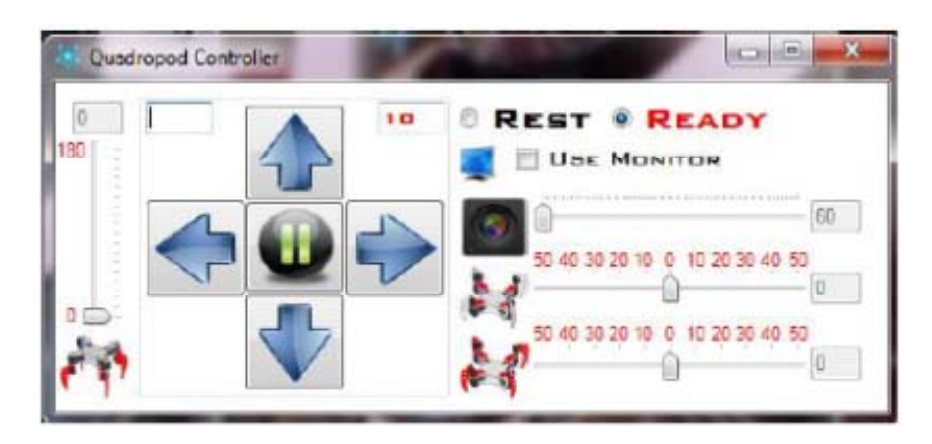
Figure 6. Controller applications display with ready active