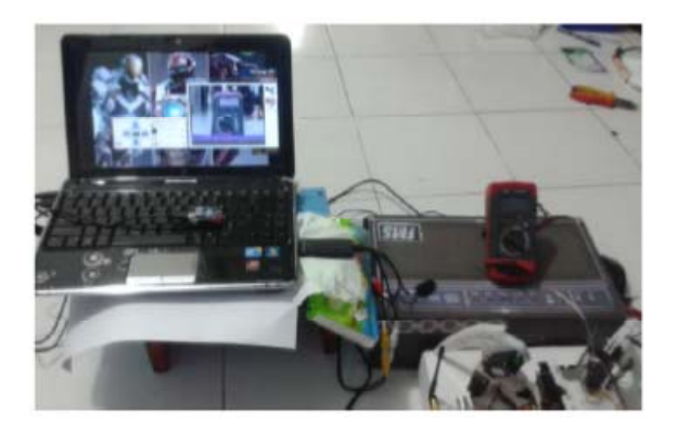
Figure 9. Video display application preview

The testing of video display application is carried out by capturing the image directly from Windows camera through wireless camera receiver. The trial result can be seen in Figure 9. Based on the result obtained, it can be seen that video display application has succeeded to display video or live view captured by wireless camera. Based on the testing toward all of control facilities in providing the command to Quadruped Robot, the result is obtained that Quadruped Robot can perform the movement which is matching with command value given on controller software well. [9]