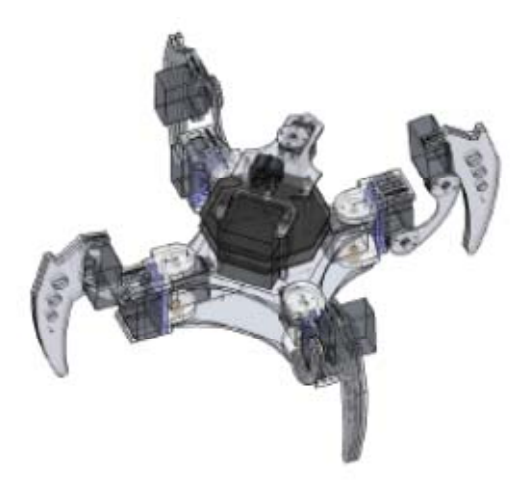
Figure 2. Design of physical form of quadruped robot

Quadruped Robot acts as an entity which its movement will be controlled. Quadruped Robot uses microcontroller ATmega1280 as a control unit and main processing unit. In Figure 2 the main driver on each foot of Quadruped Robot is using servo motor HS-225MG and HS-645MG which is used as a motor. Each foot of Quadruped Robot has 3 DOF (Degree of Freedom).