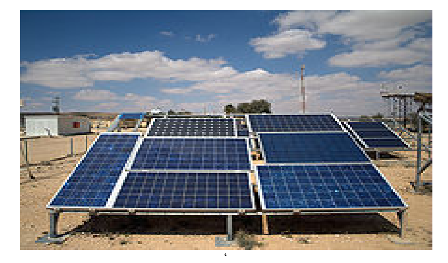
Figure 2. Photovoltaic array

First, high reliability - it has no moving parts which make it particularly suitable for remote areas. This is due to its use on spacecraft. Then, the modular nature of photovoltaic panels allows a simple and adaptable to various energy needs. Systems can be designed for power applications ranging from milliwatts to megawatts.