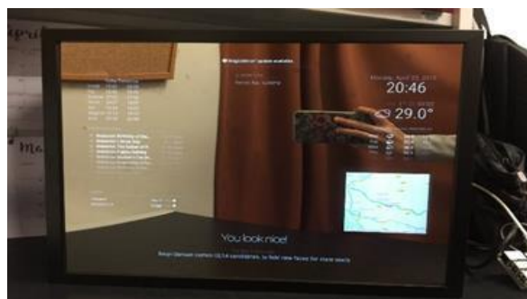
Figure 2. Interface of “BriliantReflect”

Then smart mirror only intended be used as information panel. The features of this mirror are divided into three sections. The purpose of dividing the features into these section is to differentiate the information that will be received by the user. On the right side of the mirror, information such as Clock, alarm, weather and traffic are shown to provide user with daily information. Malaysia holiday’s calendar and daily reminder of the user are displayed to ease the user in making decision. Refer Figure 2, on the other hand, the bottom section of the mirror provides daily quotes and news to motivate the user.