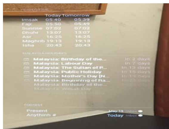
Figure 5. Holiday reminders

The smartphones are not a mandatory accessory for smart mirror but it is a very convenient way to interact with it because it acts like a remote control. That's why we provide this method for daily reminder features of this mirror. User can modify their schedule by using their phones. This is because the Todoist Application that we are using are connected with the mirror. The user also gets notifications in mirror and their phones. Holiday Calendar of this mirror are listed based on ICS Malaysia's Calendar template. The format of the calendar and the way it was sorted are determined by the template, refer Figure 5.