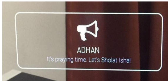
Figure 4. Alarm notification

The alarm of this mirror is already set by the user such as the exact time to wake up and the user's daily routine such as soccer, class and more. Refer Figure 4. The alarm will ring for the total of one minute. The audio of the alarm is the basic sound which will be played on the speaker of the mirror.