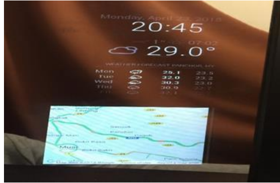
Figure 3. Date and time