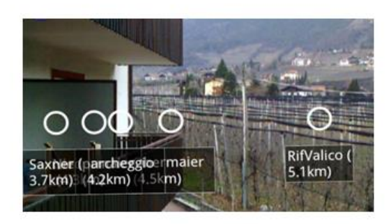
Figure 1. Standard location-based AR presentation interface of Wikitude [7] and Mixare [8]

User-centered design process could optimize the traditional development process by bringing an "early-fail" to support rapid prototyping. This process includes participatory design to capture user behaviors. Rather than focusing on fully developing a single idea to high fidelity system, the user centered design process makes rapid progress on multiple ideas toward a minimum viable product by quickly eliminating flawed concepts [9].