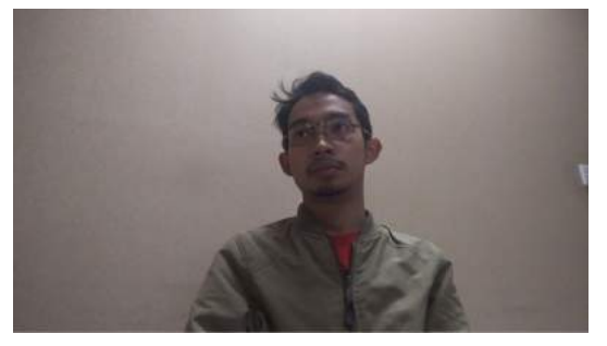
(a) First Interlucutor