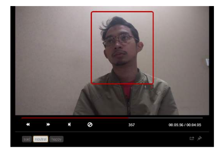
Figure 3. Example of the video while annotation process. The red square denotes the facial area of annotation.