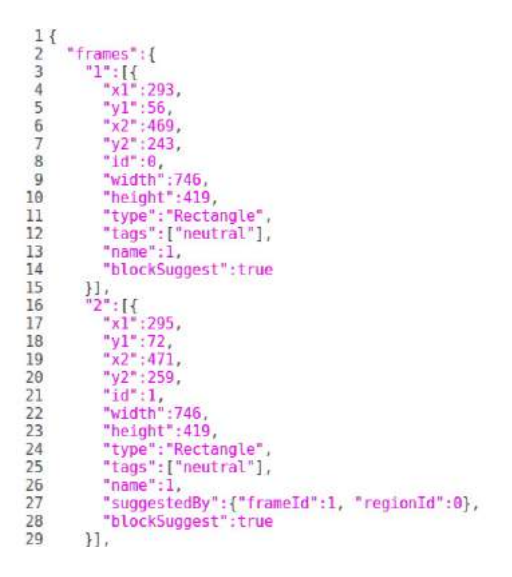
Figure 2. Part of annotated JSON example

ported to a computer. Each file will be named in the format as follows: "CONVERSATIONID_CAMERAID", where CONVERSATIONID is the identifier for the session and CAMERAID is the identifier for the device used. After the data is completely recorded, we start annotating the video for three different facial expressions, i.e., sad, neutral, and happy. Using visual object tagging tool (VOTT) [10] provided by Microsoft, we can get the annotation data in JSON format as shown in Figure 2.Furthermore, Figure 3 also describes the video example while annotating the data.